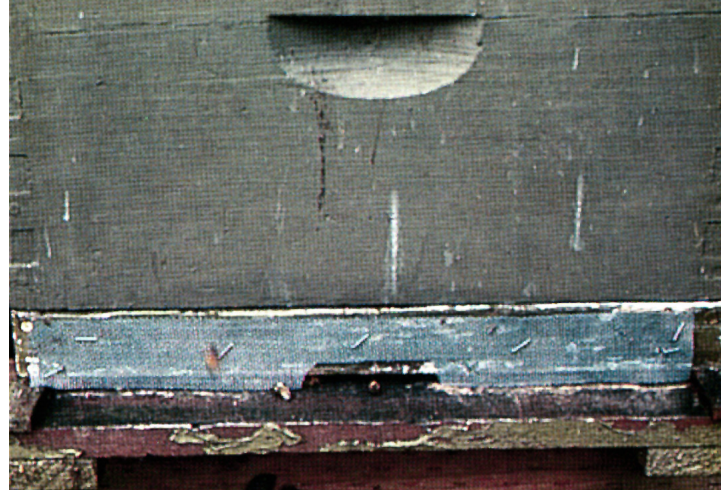
Dilly anti-yellowjacket screen.

Registered products can be found at Washington State University Extension's PestSense web site: http://pep.wsu.edu/pestsense.